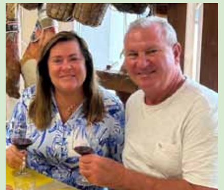
See page 12 for Virginia's Retirement story