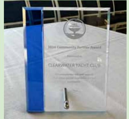
See page 5 for CYC Partners Award story & photos