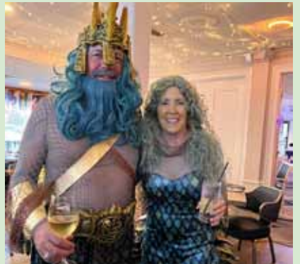
See pages 10-11 for more Halloween photos