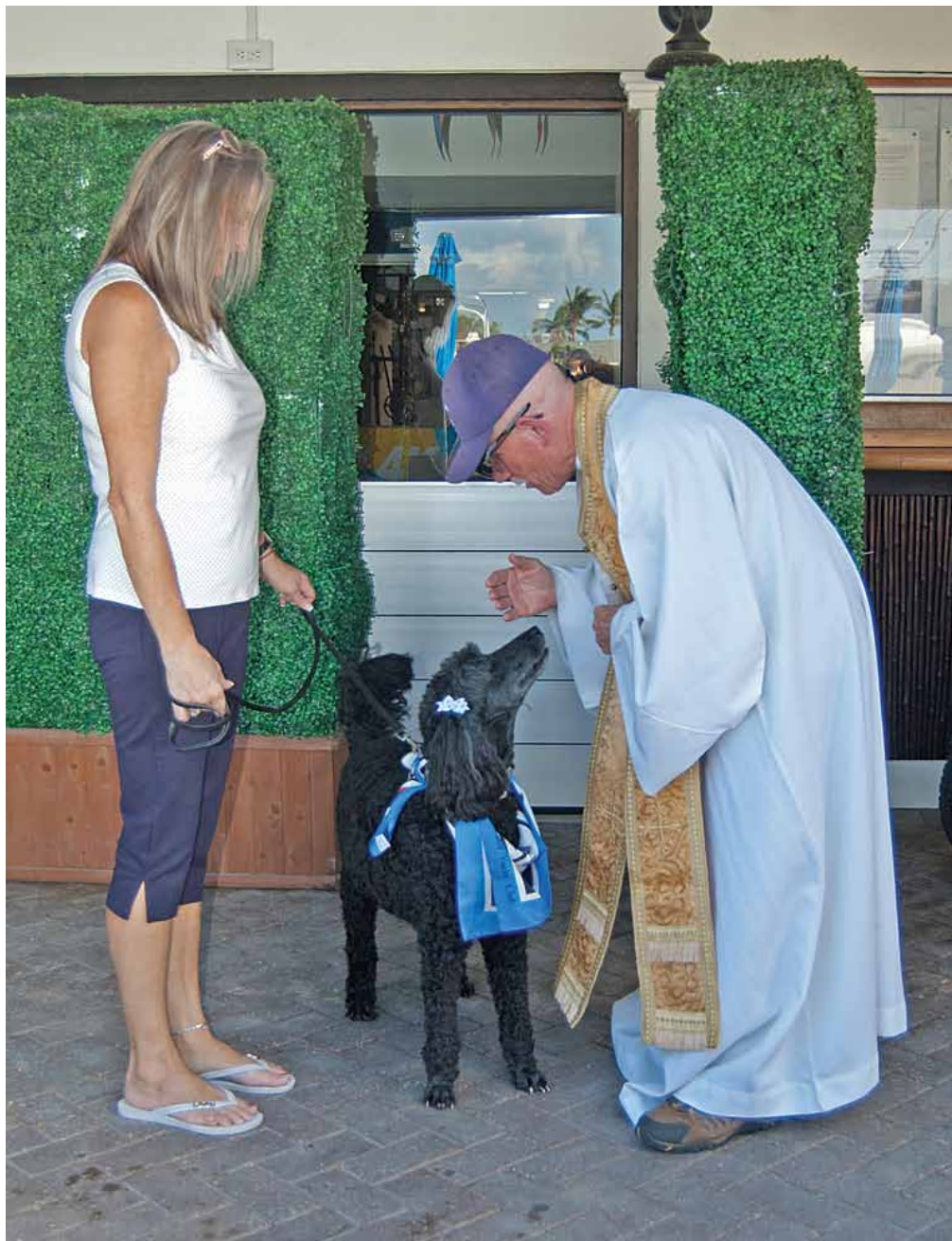
See pages 6-8 for more Pet Blessing photos