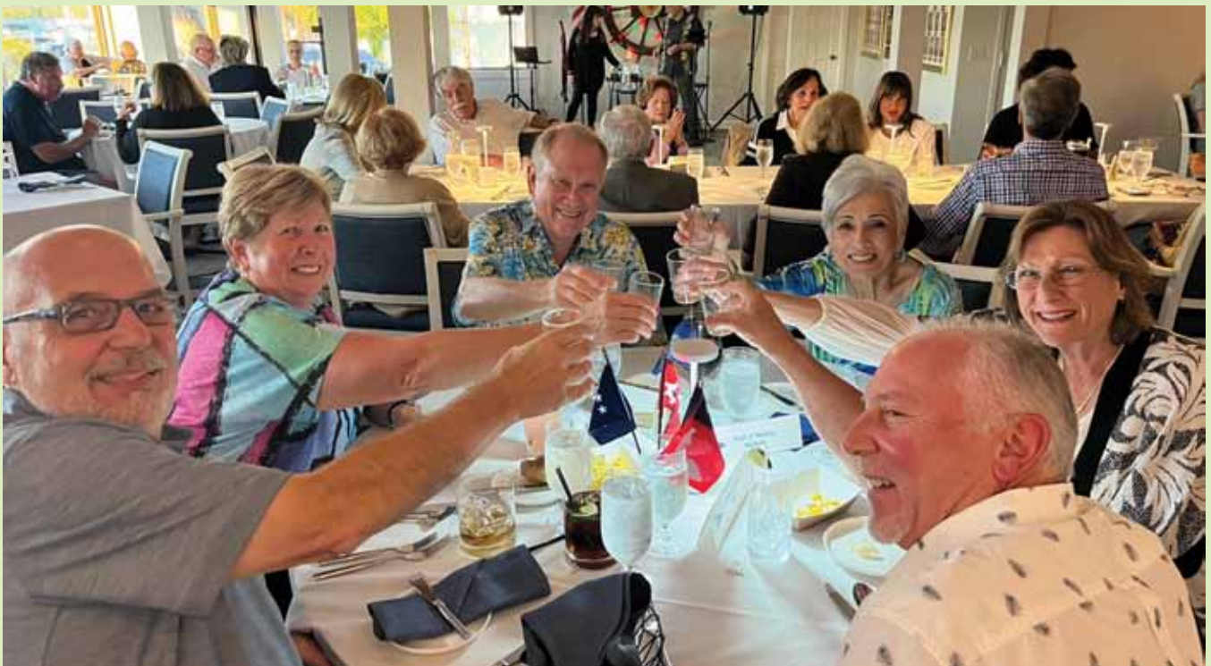
Members having shots all around for a toast to a great evening at the club. CHEERS!