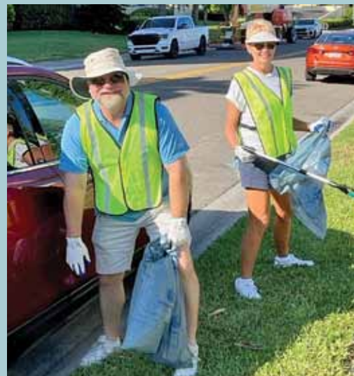
See pages 8-9 for more Big Cleanup Clearwater photos