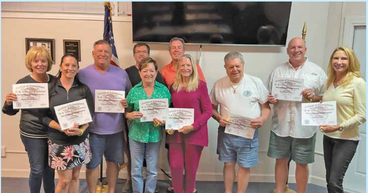
Members that attended proudly displaying their certificates after passing the class.