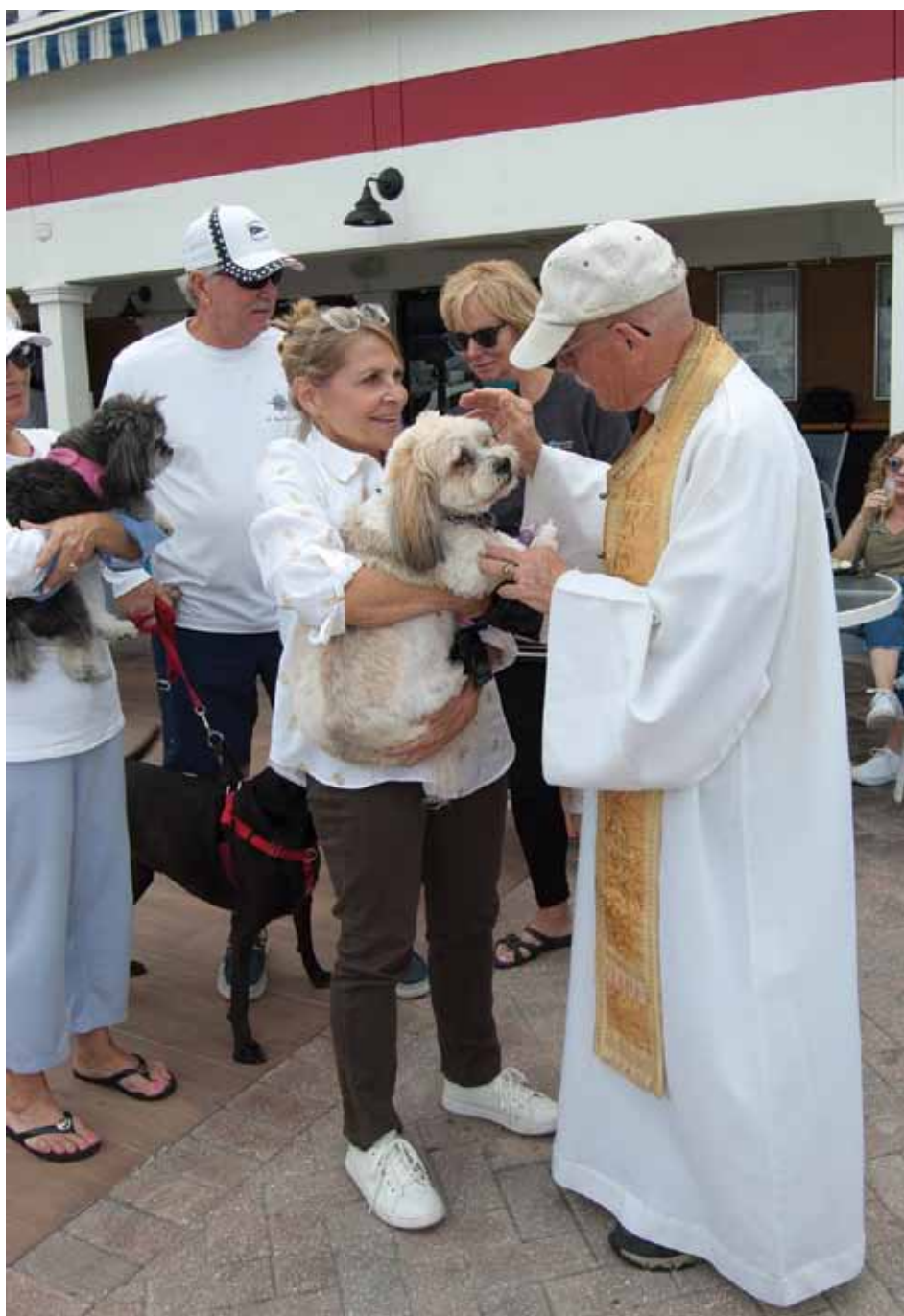
See pages 6-7 for more Annual Pet Blessing photos