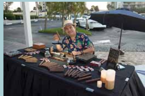
See pages 10-11 for more Havana Nights photos