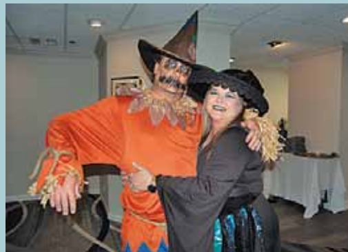
See pages 12-13 for more Halloween photos