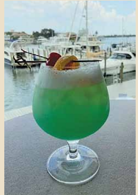
Hurri-Kane @ The Tiki

thanks to all our members who took the time and efforts to submit their liquid libation offerings. We look for-