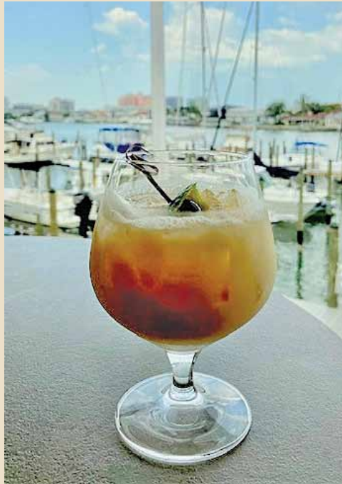
CYC Beach Cruise