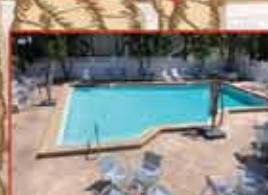
Heated and Chilled Pool

Clearwater Yacht Club is pleased to offer a Summer 2023 Membership program, with details as follows: