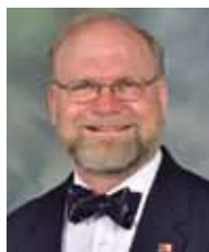
Commodore Curtis Wold