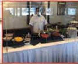
Covid Safe Dining