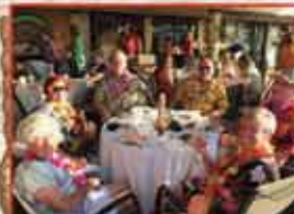
Outdoor Dining and Bar