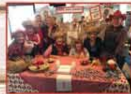
Warm Friendly People