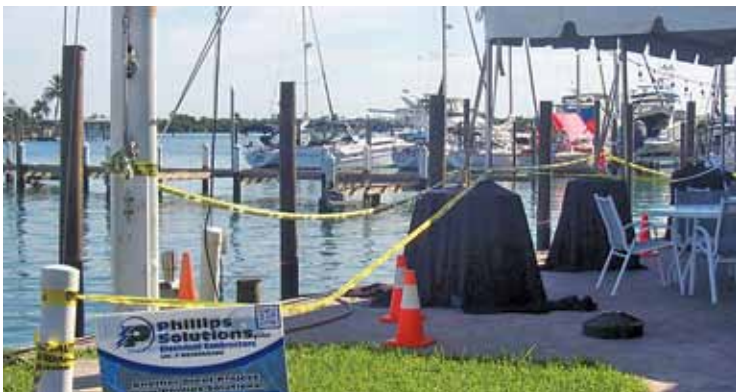
See page 8 for more Construction photos