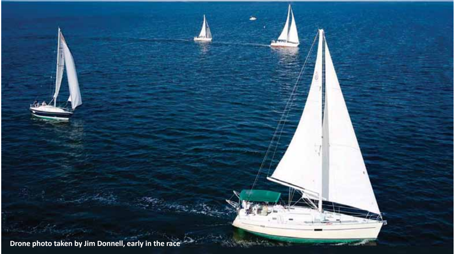
early in the race

See pages 8-9 for more Clearwater Challenge photos