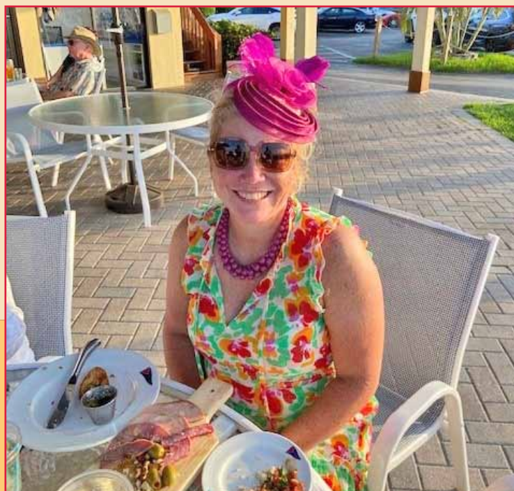
AUBREY: BEST ALL AROUND WINNER